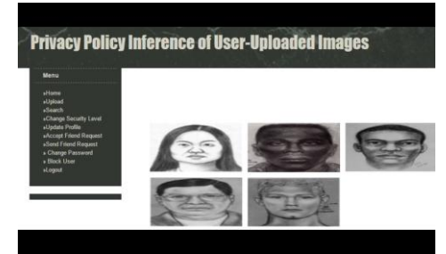
Fig 3 Search Image

This shows the recomendation of different policies to the users while uploading images.